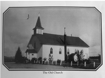
The Old Church

This year our Church building turned 50 years old. In recognition of this milestone, here are some pictures that have been uncovered to bring back memories for some parishioners- and for others they are a way of seeing where St Joseph's began.